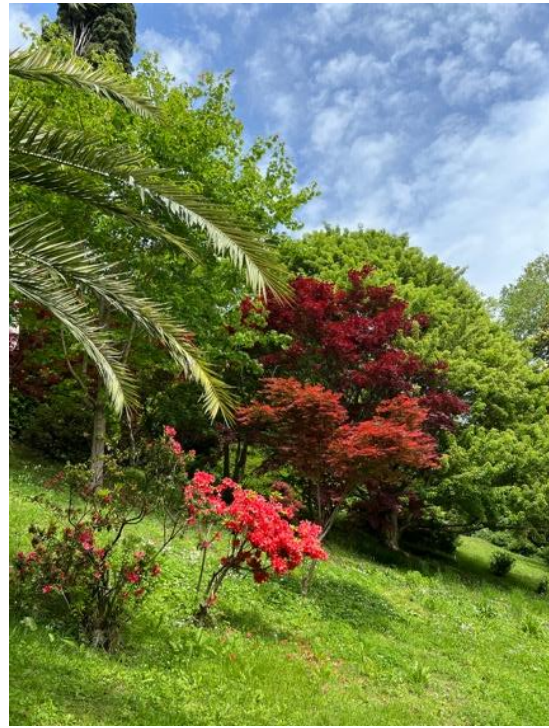
Villa Carlotta in Tremezzo, Como, Italy

June: After seeing my mum in London, I flew to Thailand for a 2-week stay in Phuket.