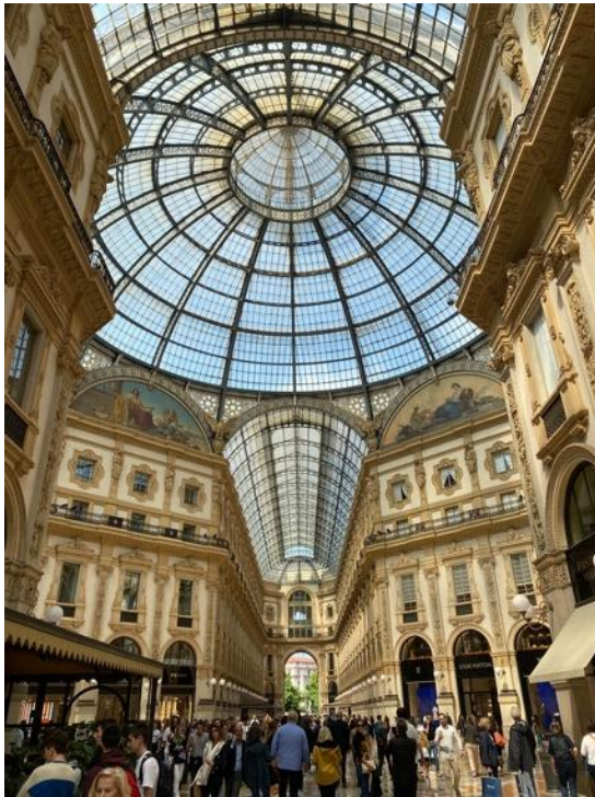
Galleria Vittorio Emanuele II in Milan

May: I traveled to Italy where I met up with some of my HKUST friends on exchange in Europe.