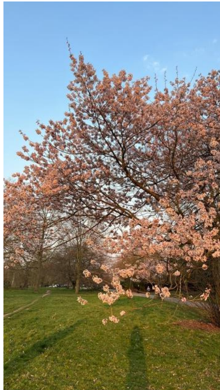
The cherry blossoms in Hyde Park

April: As classes had ended by this time, I traveled to Greece and France and completed my remaining assignments while traveling.