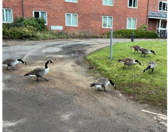
The geese in the courtyard outside the hall

February: Attended my seminars/tutorials and met my classmates and professors for the first time. Traveled back and forth between London and Warwick, and managed to make a day trip down to Brighton.