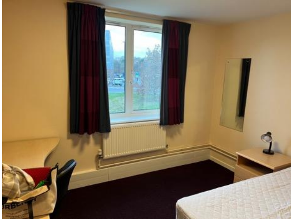
My dorm when I just checked in

January: Spent it in Hong Kong due to flight delays and cancellations. Arrived in London on 31 st January after being threatened by Warwick to cancel my exchange position.