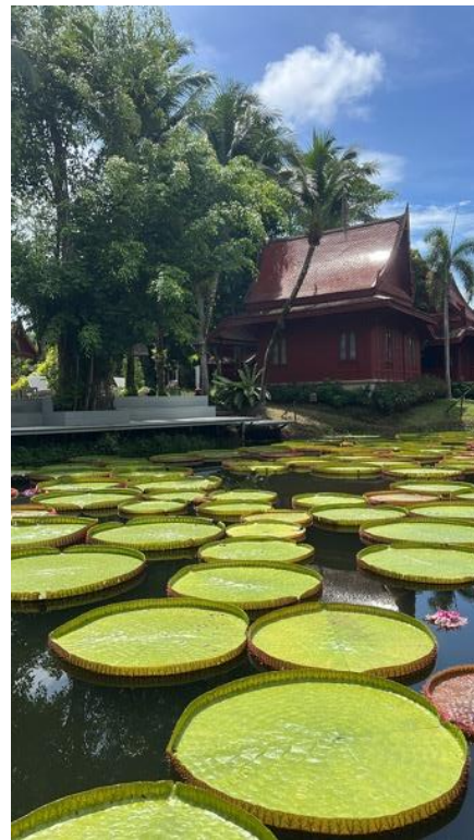
Lilypads at Ma Doo Bua Phuket

July: Finally returned to Hong Kong by the 1 st of July and quarantined for 1 week.