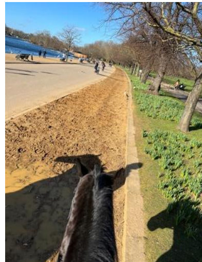
Went horseback riding in Hyde Park