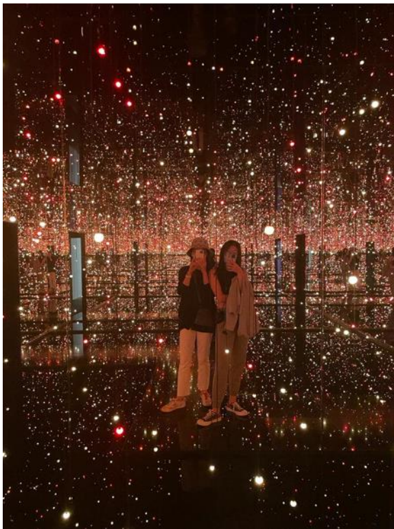
Visited the Yayoi Kusama exhibit in the Tate Modern

June: After seeing my mum in London, I flew to Thailand for a 2-week stay in Phuket.