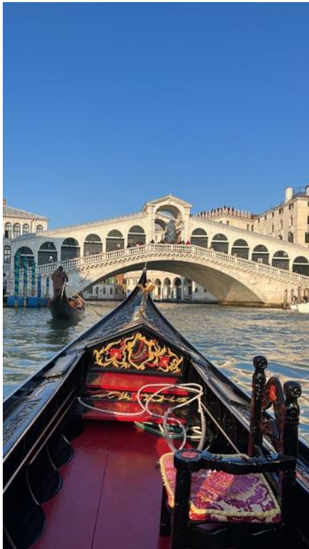
Rialto Bridge from a gondola in Venice

March: I submitted my first assignment for my marketing module and went to Venice for the weekend.